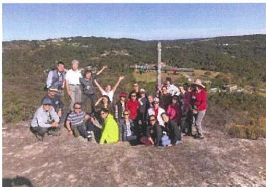
Some Alpha Attendees did The Climb to Mount Kedron - Alpha Weekend Away – June 2019

All of us have a desire for happiness. We may seek it in different ways, but deep down we yearn for something more but don't necessarily know what it is and sometimes we find ourselves asking "What is this life all about?" Only God can completely and perfectly satisfy the human heart.