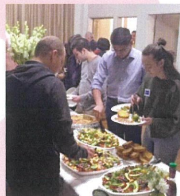
Sharing A Meal

involves a very real and personal relationship with Jesus. There is simply something much deeper than knowing about Him, it's the life changing experience of knowing Him. For many, when they experience this, it is totally life changing, and many find a yearning for more. Alpha helps you to come to know Jesus in a personal way through a series of interactive sessions. It allows us to ask the big questions of life.